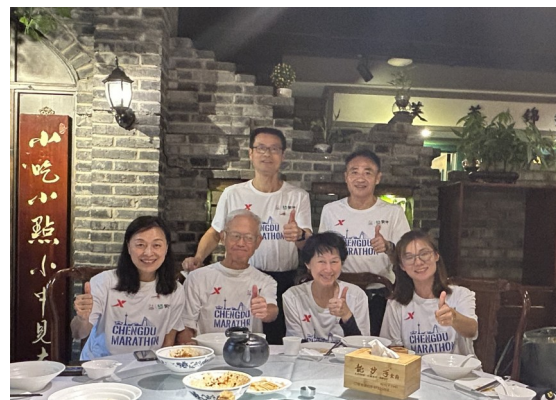
Marathon participants wearing the event T-shirts